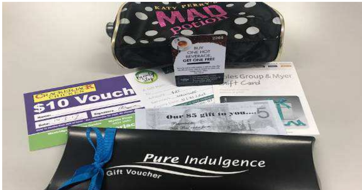
Passport - Service Providers Attending Expo: